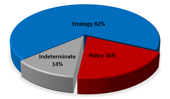
Figure 2. Status of digital health policy in Africa

only 36% are policies as shown in Figure 2. This is an indication that majority of the African countries may not be having digital health policies yet Africa is home to the largest number of digital health initiatives.